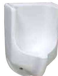
KALAHARI™ #2004 / #2004B