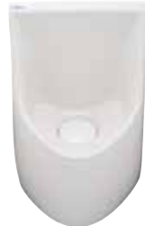
SANTA FE™ #2903