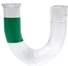
Building Side Only