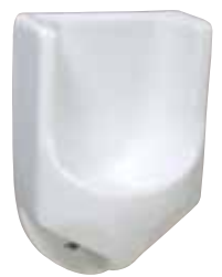
SONORA™ #2003 / #2003B