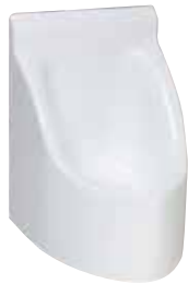
DEL CASA™ #2902